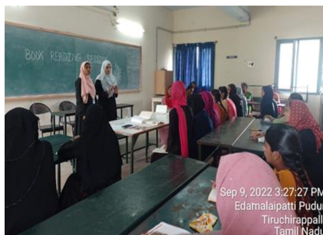
Staff members encouraged students to study more