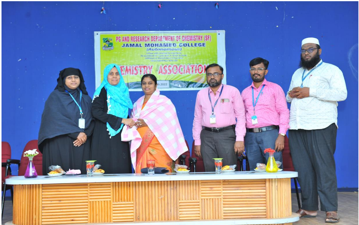
Honoring our beloved Resource Person