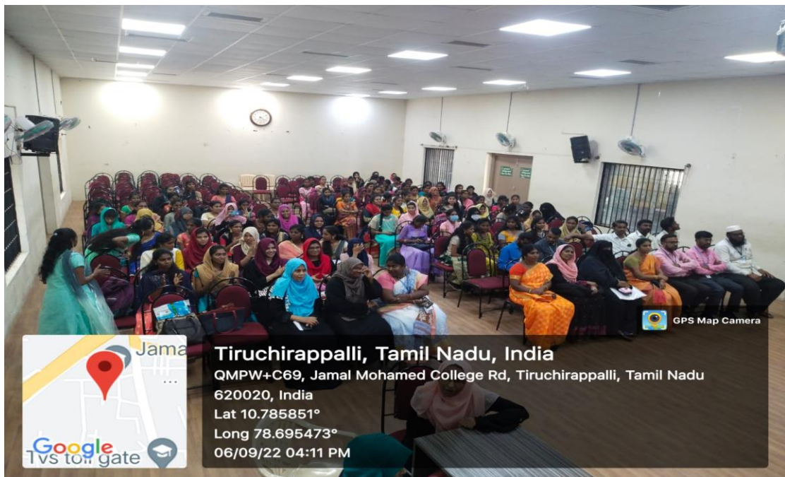
Over all view of the Audience