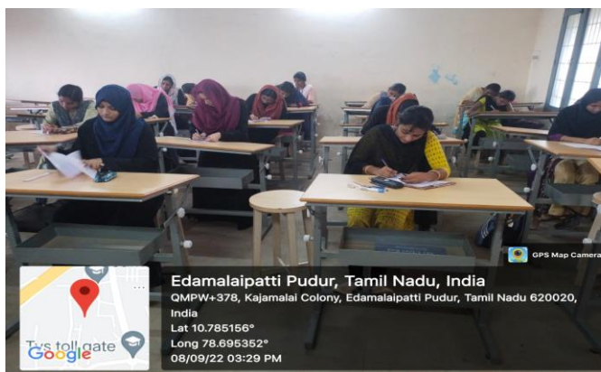
Students participated in essay writing competition