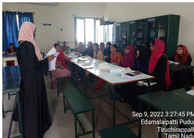
Students at Book Reading Session