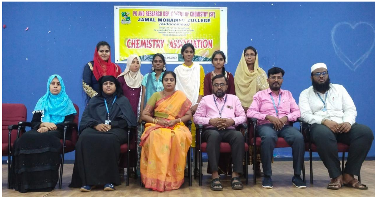
Association office bearers (2022-2023) with chief guest and faculty members