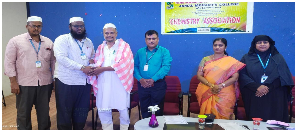
Honoring our beloved Additional Vice-Principal and Head of the Department of Chemistry