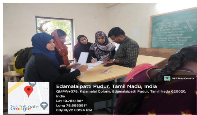
Monitoring of students by our staff members